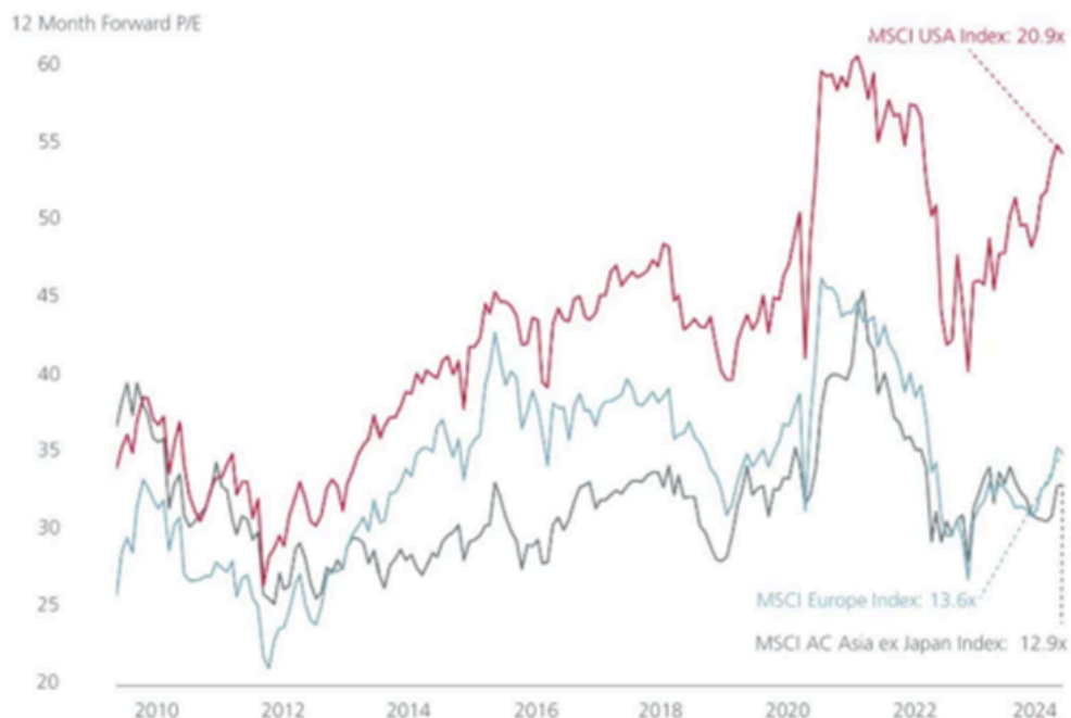
IBES MSCI 12 forward P/E: US vs. Asia ex-japan